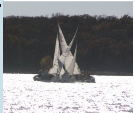
Two boats crossing during the Hiram Douglas Regatta 2009

teerism in the club. Whether you are a complete novice or a dedicated racer, you will find helping hands and good advice. We have 12 US Sailing certified sailing instructors and one instructor trainer. Many of our members have raced in regional regattas, and several in national events. The cruising group has sent members to Lake Texoma, the Gulf Coast, Bahamas, British Virgin Islands, and Chesapeake Bay. And should you need it, the club's collective wisdom on boat repair, rigging, launching, marinas, etc., is extensive. TSC is also proud to sponsor Sea Scout Ship 5790.