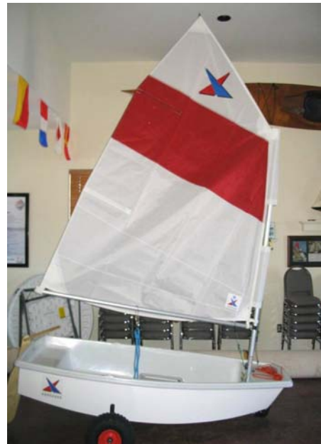
The new Vanguard Prams